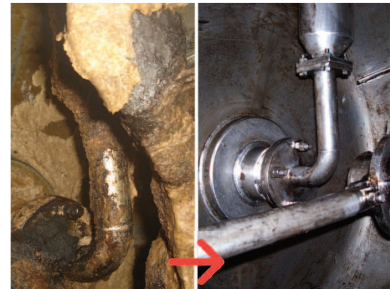
Removal of chocolat and caramel