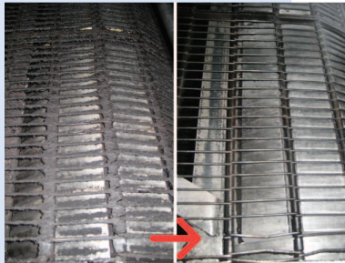
Cleaning conveyor - chain